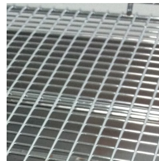
Cross Pattern Shelf