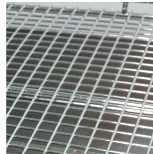
Cross Pattern Shelf